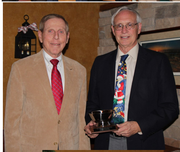
A P W R A E R S D E S N T A T I O N